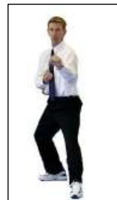
6. No L-STANCE, Guarding Block

Extend both hands, palms down, parallel to the floor while lowering the body by bending at the knees)