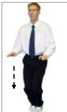
5. Loss of Balance

(Extend both hands, palms down, parallel to the floor, extend leg in front, touch foot to floor twice)