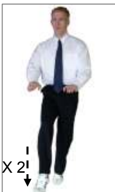
4. Stepping Error

(Extend both hands, palms down, parallel to the floor, extend leg in front, touch foot to floor twice)