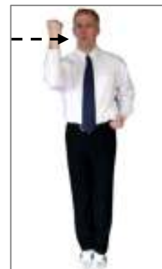
3. Incorrect Technique