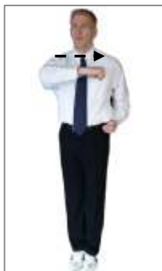
2. Illegal / Incorrect Tool

(Execute a turning punch, touching the opposite hand twice)