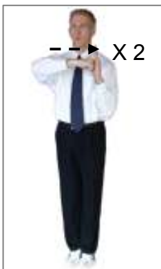
1. Touching the Board more than Once

(Execute a turning punch, touching the opposite hand twice)